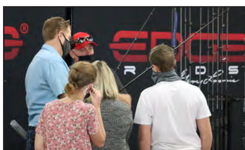
O'Loughlin Sport Shows have the reputation of being the most productive consumer shows in the United States. Hundreds of millions of dollars of sales are made through the three shows.