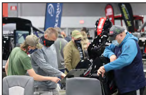
The boat sales that occur at our Sport Shows account for as much as 30% of some dealers annual sales.