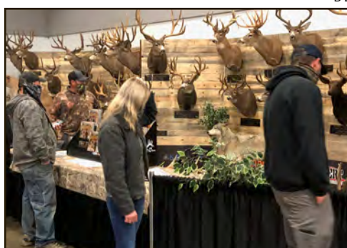
The Wall of Kings and Head and Horns Competition draws entries from across the Northwest and adjacent states.